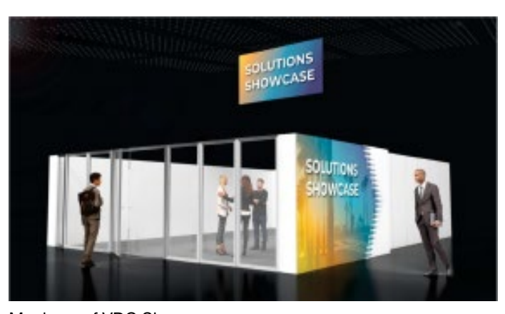
Mock-up of VDC Showcase